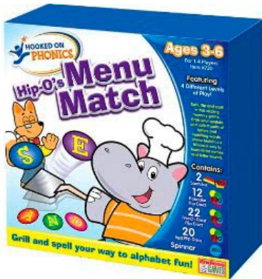
Hip-O's Menu Match

Most of these items can be found at your local Target or Wal-Mart, but, we also recommend checking out TJ Max, Ross, and Marshalls. They usually have some great items at discounted prices. Also, don't forget about local consignment shops; these are good places to find gently used toys at low prices.