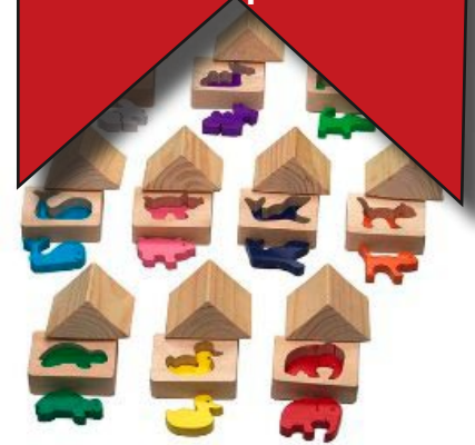
Who Lives Where?