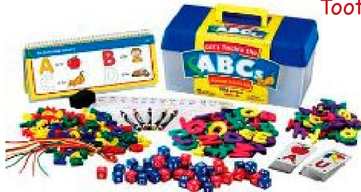
Let's Tackle the ABC's

Most of these items can be found at your local Target or Wal-Mart, but, we also recommend checking out TJ Max, Ross, and Marshalls. They usually have some great items at discounted prices. Also, don't forget about local consignment shops; these are good places to find gently used toys at low prices.