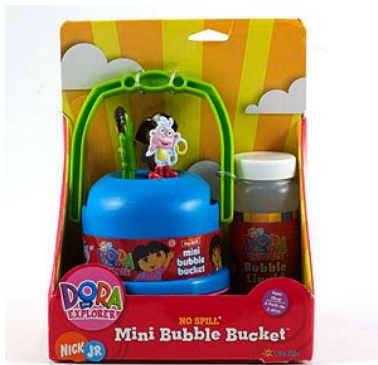
No Spill Bubble Tumbler