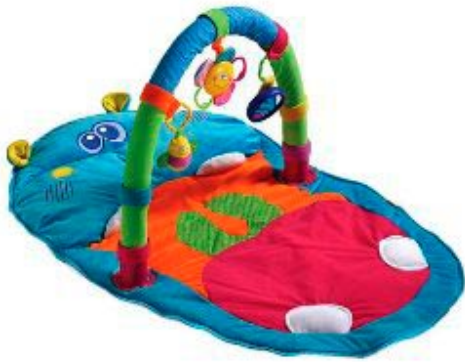
Happy Hippo Gym

Tummy Time Cause & Effect Oral Motor Reading